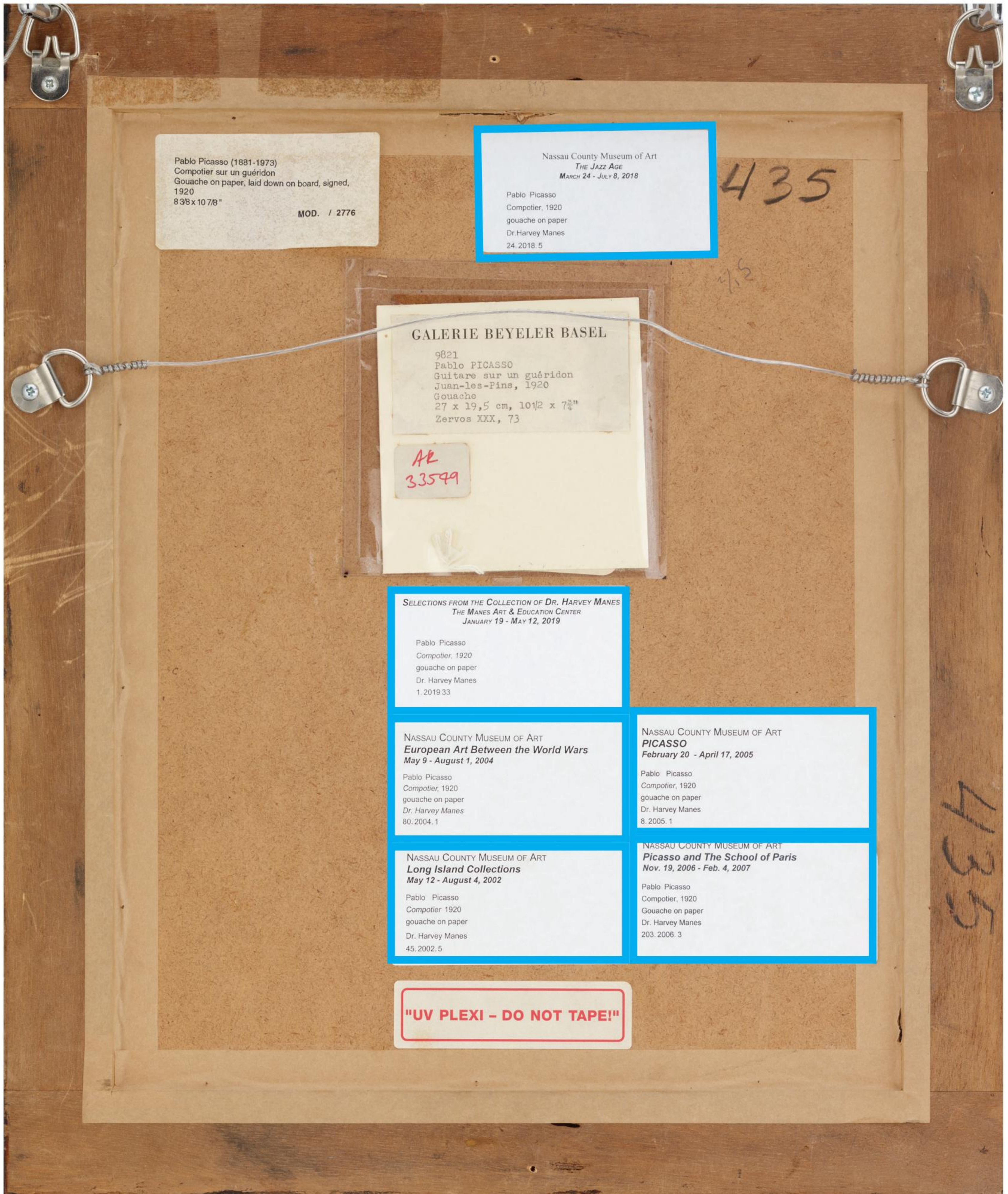
Back of painting with exhibition labels