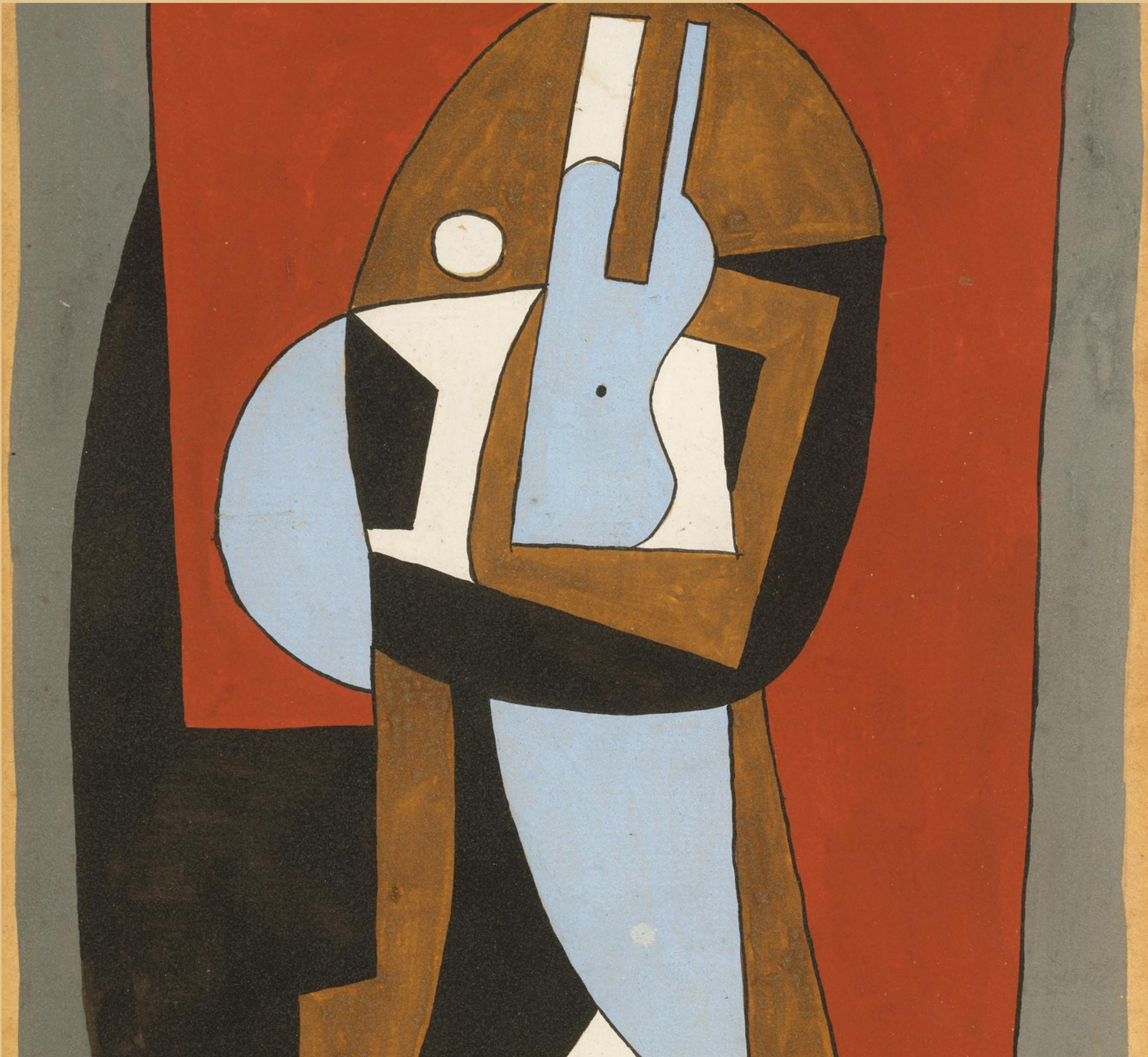
Guitare sur un guéridon